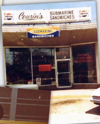
Our first store. 1972